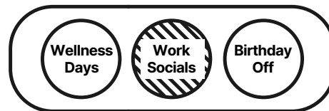
Fig. 4. The Benefits

Interested? Send us your profile at hannahsutcliffe@themoonhub.com